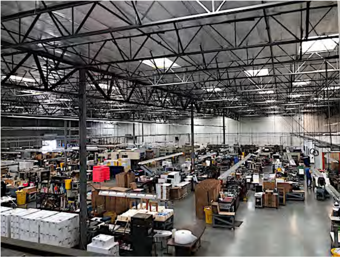
Presentation Folder plant for printing and fulfillment.