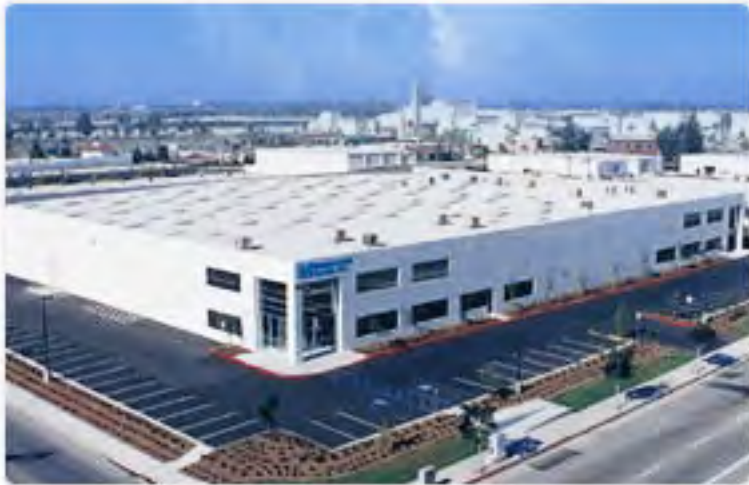
Presentation Folder, Inc. plant in Orange, California.